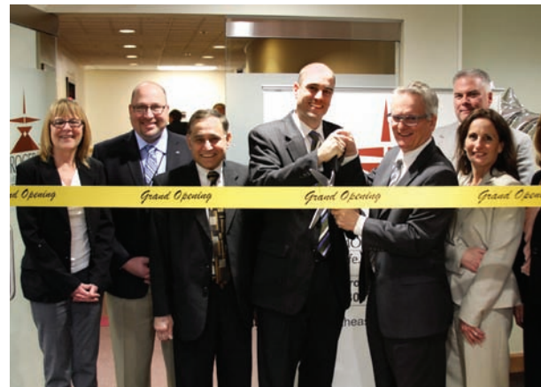
Ribbon cutting at Rogers Memorial Hospital–West Allis at Lincoln Center